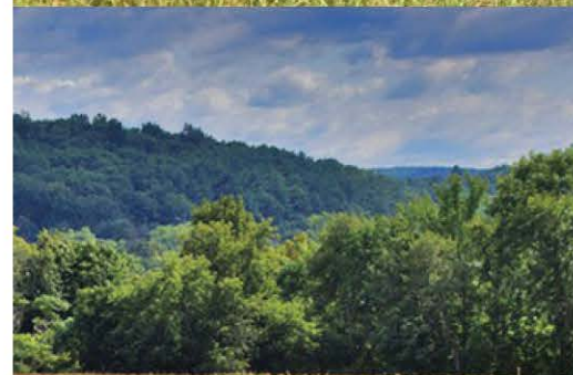
Cows in pasture at Otter Creek Farm (top); Field at Betts Farm (bottom)