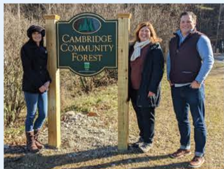
Forest officially opens to the public in November 2021

ASA receives a grant from the Charles R. Wood Foundation to design and create a Sensory Trail in the forest