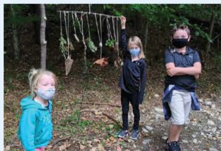
Four Wild Art programs are conducted at the forest for community members of all ages