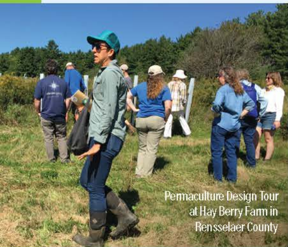
Permaculture Design Tour at Hay Berry Farm in Rensselaer County